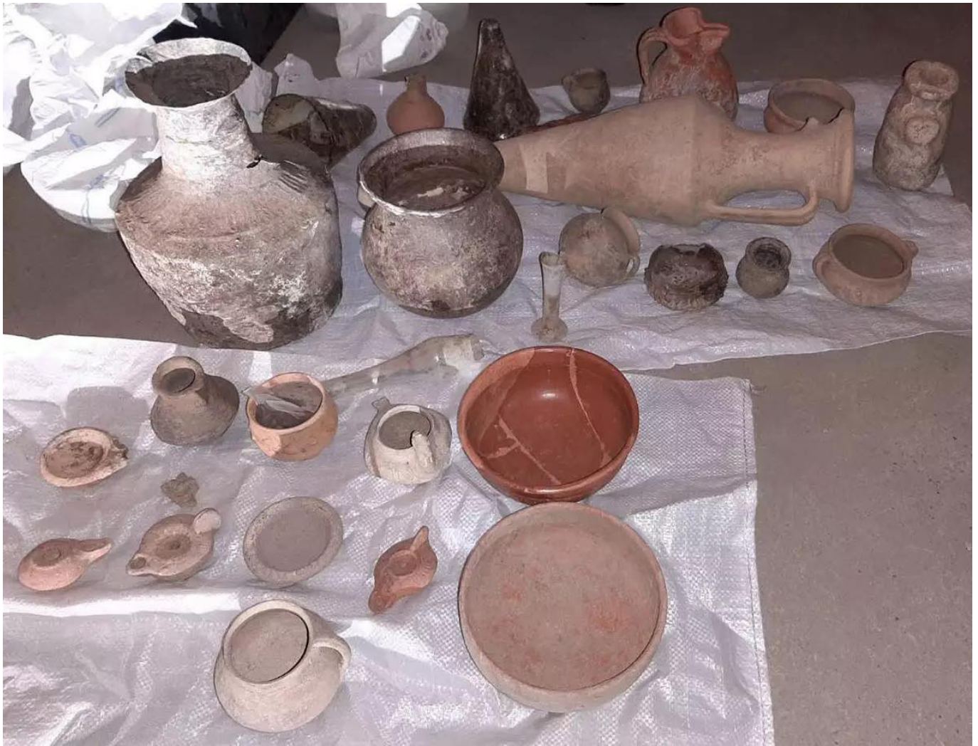
Fig. 9. Operation MEDICUS https://www.europol.europa.eu/media-press/newsroom/news/police-recover-%E2%80%998millions%E2%80%999-in-stolen-treasures-after-busting-archaeological-crime-gang-in-bulgaria