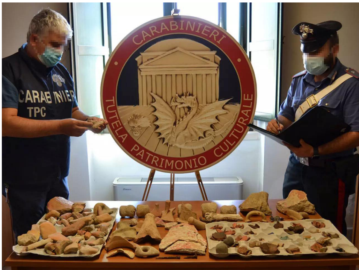
Fig. 3. The 2020 edition of the Pandora operation https://www.europol.europa.eu/media-press/newsroom/news/over-56-400-cultural-goods-seized-and-67-arrests-in-action-involving-31-countries