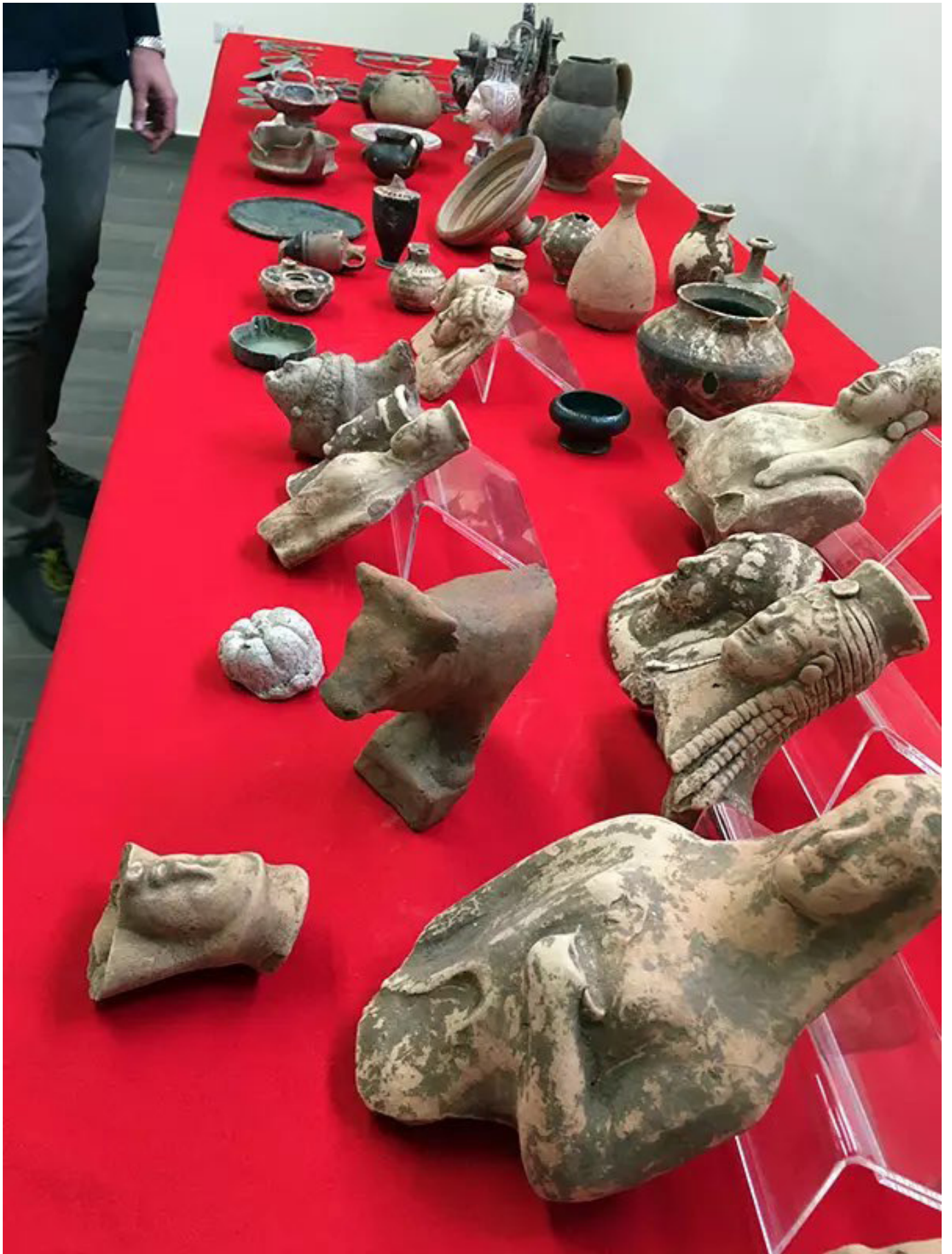
Fig. 5. Operation Achei https://www.europol.europa.eu/media-press/newsroom/news/23-arrests-and-around-10-000-cultural-items-seized-in-operation-targeting-italian-archaeological-trafficking