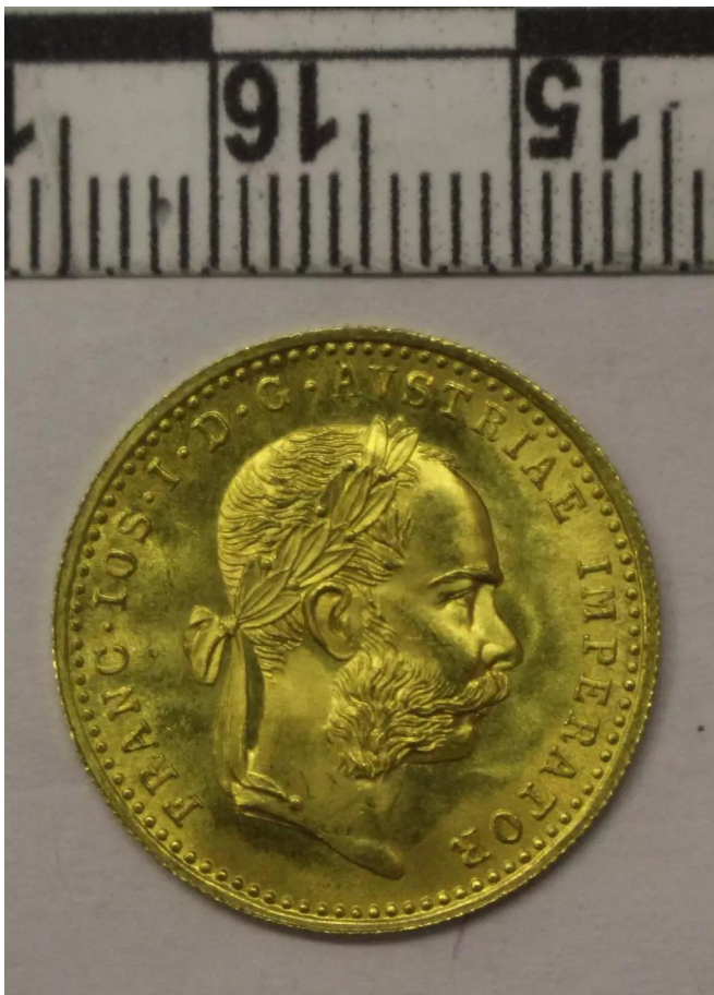
Fig. 7. Operation ATHENA II https://www.europol.europa.eu/media-press/newsroom/news/101-arrested-and-19000-stolen-artefacts-recovered-in-international-crackdown-art-trafficking