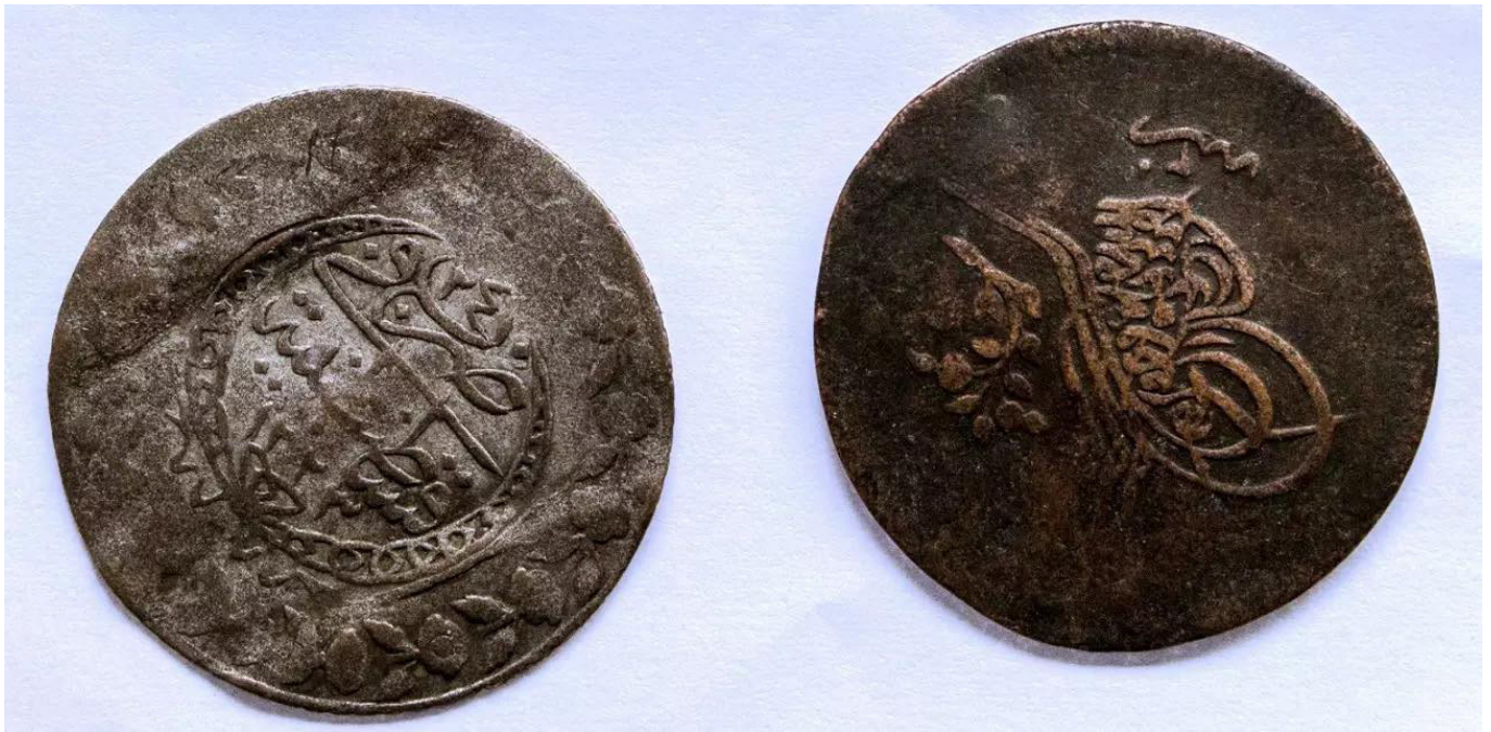
Fig. 11. Operation Pandora III https://www.europol.europa.eu/media-press/newsroom/news/over-18-000-items-seized-and-59-arrests-made-in-operation-targeting-cultural-goods