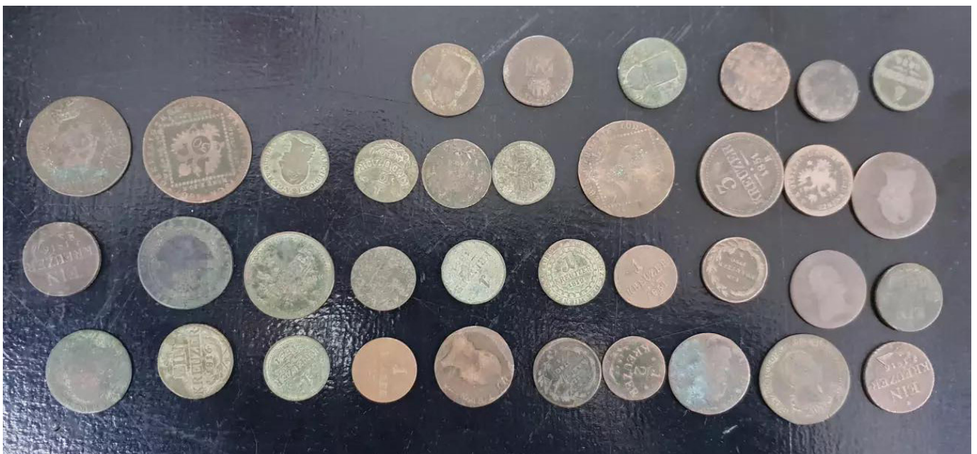
Fig. 10. Operation Pandora III https://www.europol.europa.eu/media-press/newsroom/news/over-18-000-items-seized-and-59-arrests-made-in-operation-targeting-cultural-goods