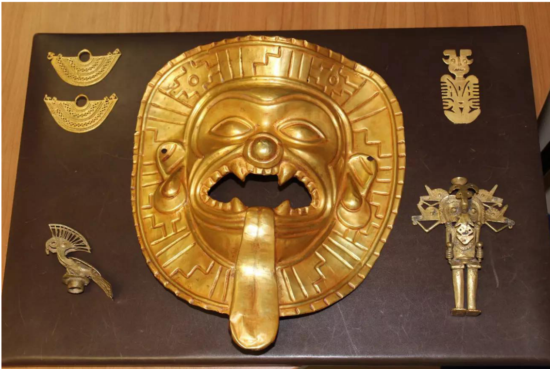
Fig. 6. Operation ATHENA II https://www.europol.europa.eu/media-press/newsroom/news/101-arrested-and-19000-stolen-artefacts-recovered-in-international-crackdown-art-trafficking