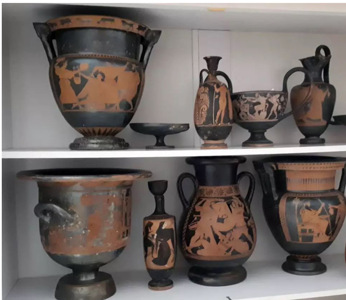
Fig. 4. Operation Achei https://www.europol.europa.eu/media-press/newsroom/news/23-arrests-and-around-10-000-cultural-items-seized-in-operation-targeting-italian-archaeological-trafficking