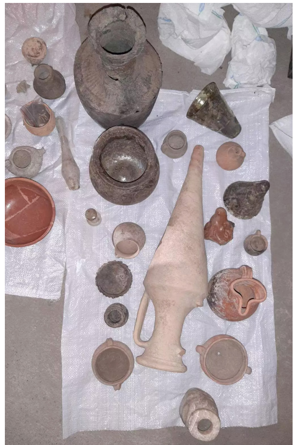
Fig. 8. Operation MEDICUS https://www.europol.europa.eu/media-press/newsroom/news/police-recover-%E2%80%9898millions%E2%80%99-in-stolen-treasures-after-busting-archaeological-crime-gang-in-bulgaria