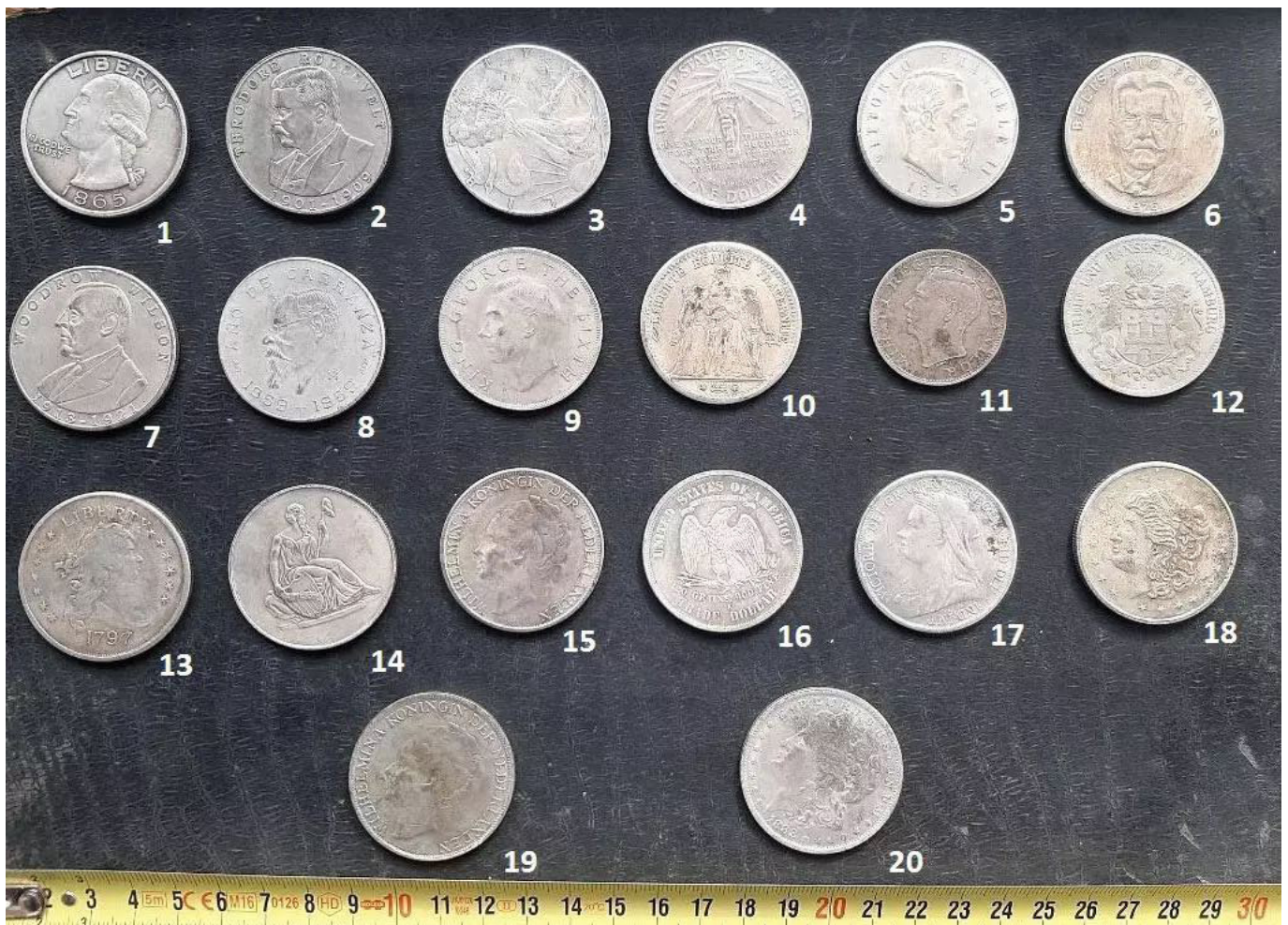
Fig. 2. The 2020 edition of the Pandora operation https://www.europol.europa.eu/media-press/newsroom/news/over-56-400-cultural-goods-seized-and-67-arrests-in-action-involving-31-countries