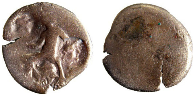
9. Histria, type "Apollo on the omphalos " Material: bronze Weight: 3.19 gr.; Diameter: 19 mm; Axis: - Dating: 70-30 BC?

Obverse: the silhouette of Apollo seated left on the omphalos , holding arrow in left hand.