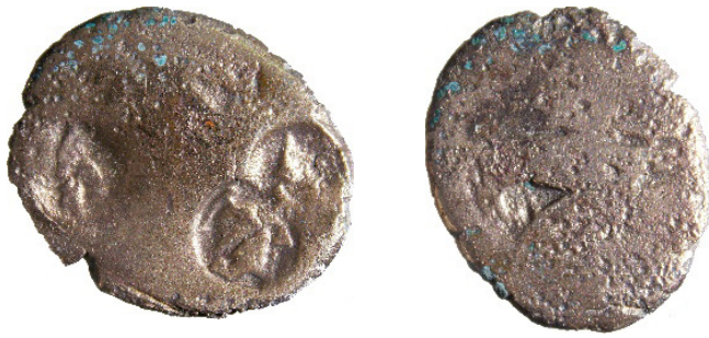
13. Histria, type "Apollo on the omphalos"?