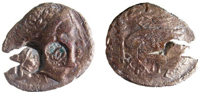
6. Histria, type "Apollo", magistrate XAI? Material: bronze Weight: 4.80 gr.; Diameter: 21.7x17.8 mm; Axis: 12 Dating: 170-70 BC Obverse: Laureate Head of Apollo, right. Reverse: Eagle on dolphin to left; on the left, lotus branch upright. Inscription: XAI under dolphin. Countermarks: Obverse: head of Helios (diameter: 5.7mm); head of Hermes, right (diameter: 6.1 mm). Catalogue: cf. SNG XI, 210. Remark: The abnormal position of letters PE beside the others, XAI, and a fragment of another design on the obverse, beneath Apollo's neck, indicate a re-struck coin. This re-striking has also helped the appearance of cracks at the moment of countermarking, as the coin flan was already thinner.