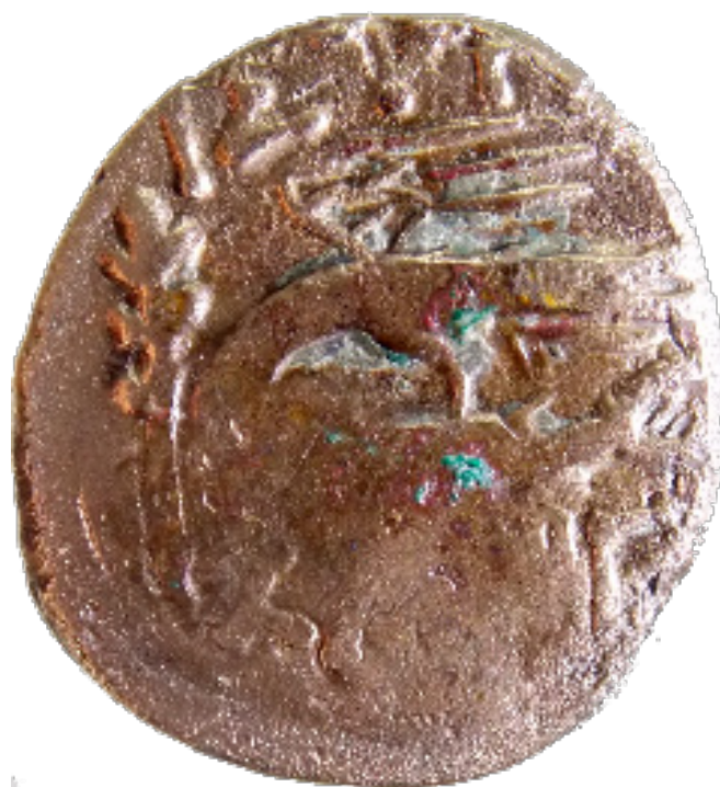
Fig. 4. Bronze Histrian coin, type Apollo. Eagle on dolphin; on left, laurel branch.

and in most of the cases, in front of the eagle is the laurel branch/'corn-ear' (fig. 4).