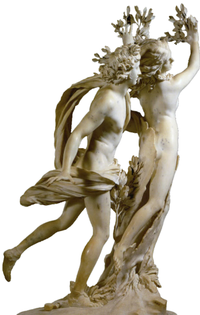
Fig. 2. Apollo and Daphne (1622-1624) by Gianlorenzo Bernini

filled with sadness, proclaimed this tree as his sacred one (fig. 2) 12 .