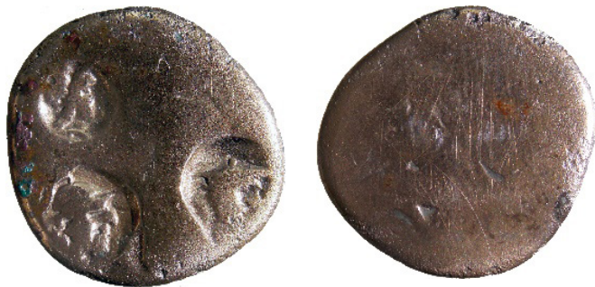
10. Histria, type "Apollo on the omphalos " Material: bronze Weight: 3.54 gr.; Diameter: 19.9 mm; Axis: - Dating: 70-30 BC?

Obverse: erased. (based on the weight, sizes, countermarks, worn out level, most likely, the coin was one of the type Apollo on the omphalos )