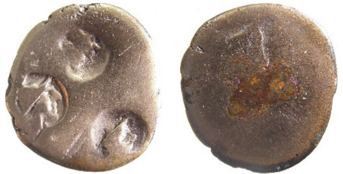
12. Histria, type "Apollo on the omphalos "?