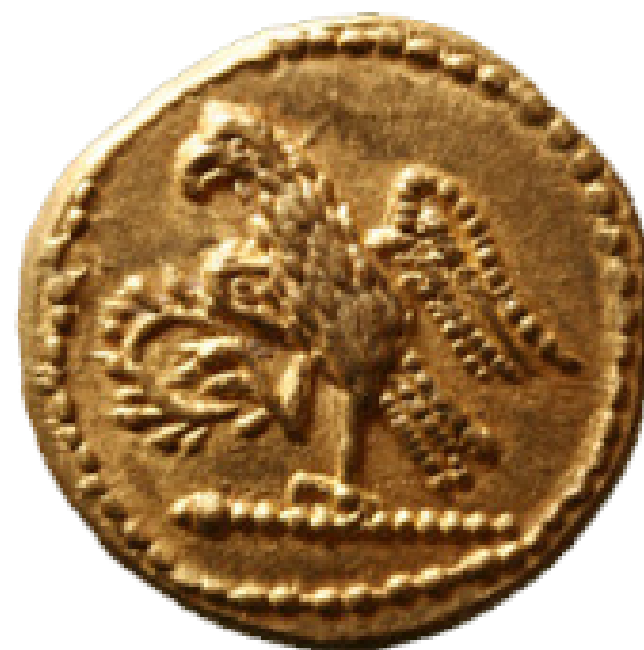
Fig. 5. Gold Koson. Eagle holding sceptre and laurel wreath.

The interpretation of the coin iconography by the users according to their personal religious believes/perceptions is a demonstrated act. A representative example on this vein comes from those coins with an iconography connected to the grape vine. Previously, such coins have been associated with the wine trade, but, lately, it has been demonstrated