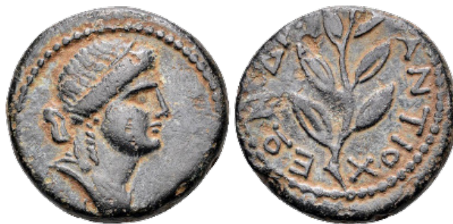
Fig. 3. Coin minted in Antioch, Syria, in AD 55/56. On obverse, Head of Apollo, right. On reverse, laurel branch. RPC I, 4289.

the laurel-branch and the corn-ear. A recent catalogue also describes the discussed object as a laurel branch 13 . This coin assembly is one of high historical importance due to its specific meaning but also if it is regarded in a wider historical context.