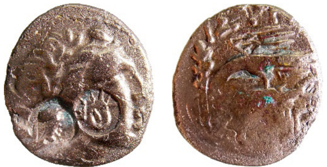
8. Histria, type "Apollo", magistrate XAI Material: bronze Weight: 5 gr.; Diameter: 19.2x17.7 mm; Axis: 12 Dating: 170-70 BC Obverse: Laureate Head of Apollo, right. Reverse: Eagle on dolphin to left; on the left, lotus branch upright. Inscription: ΙΣΤ... above the eagle. XAI? under dolphin. Countermarks: Obverse: head of Helios (diameter: 5.7mm); head of Apollo, right (diameter: 5.1 mm). Catalogue: cf. SNG XI, 210.