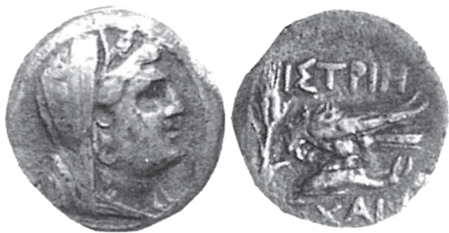
Fig. 1. Histria. Demeter type – with corn-ear. SNG IX, 261.

filled with sadness, proclaimed this tree as his sacred one (fig. 2) 12 .