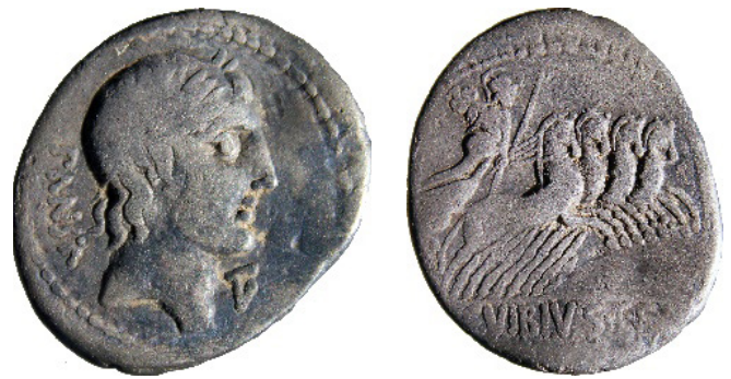
15. C. VIBIUS PANSA