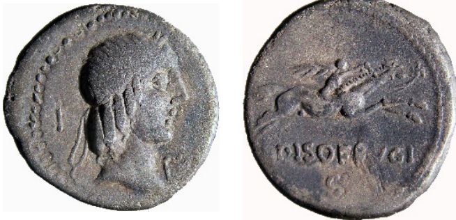
14. L. CALPURNIUS PISO FRUGI