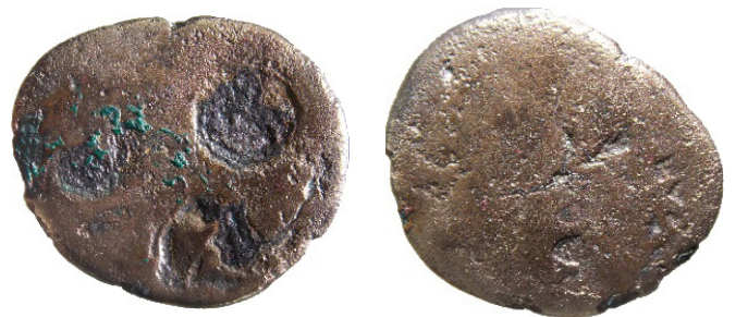
11. Histria, type "Apollo on the omphalos "?