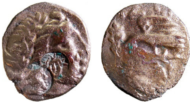
5. Histria, type "Apollo", magistrate XAI Material: bronze Weight: 4.07 gr.; Diameter: 19x17.3 mm; Axis: 11 Dating: 170-70 BC Obverse: Laureate Head of Apollo, right. Reverse: Eagle on dolphin to left; on the left, lotus branch upright. Inscription: ΙΣΤ... above the eagle. [X]AI under dolphin. Countermarks: Obverse: head of Helios (diameter: 5.7mm); head of Hermes, right (diameter: 6.1 mm). Catalogue: cf. SNG XI, 210.