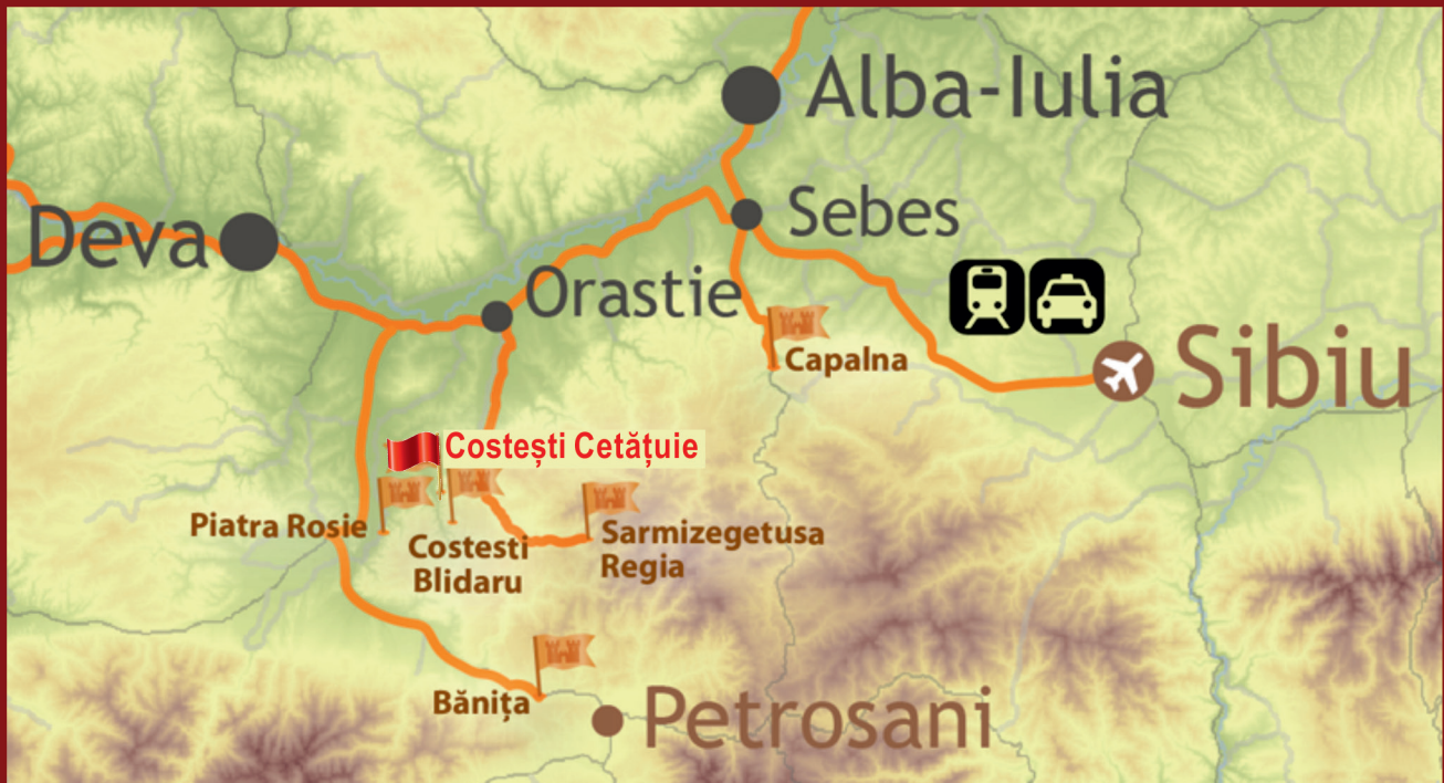
Map. 2. Romania. The area of the Dacian fortresses in the Orăștie Mountains - detail ( https://www.cetati-dacice.ro/en/community/access-map )