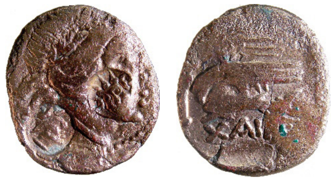
7. Histria, type "Apollo", magistrate XAI Material: bronze Weight: 4.61 gr.; Diameter: 19.6x17.3 mm; Axis: 12 Dating: 170-70 BC Obverse: Laureate Head of Apollo, right. Reverse: Eagle on dolphin to left; on the left, lotus branch upright. Inscription: XAI under dolphin. Countermarks: Obverse: head of Helios (diameter: 5.7 mm); head of Hermes, right (diameter: 6.1 mm). Catalogue: cf. SNG XI, 210.