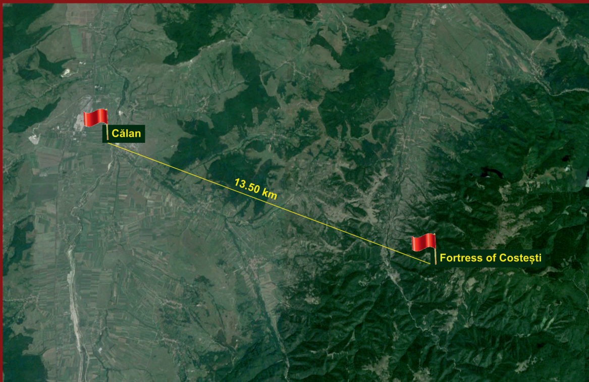
Map 4. The straight line distance between the fortress from Costești and the city of Călan (based on Google Earth)